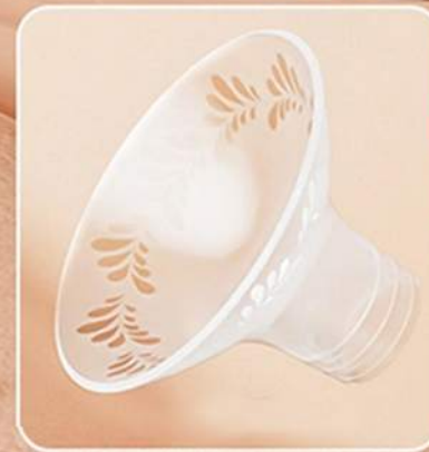
Neno breast pumps