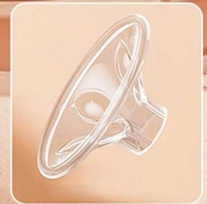
Other breast pumps