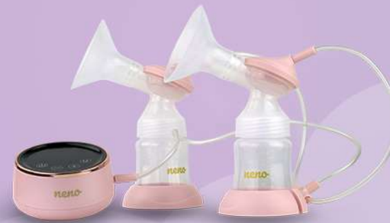
Neno Bella Twin